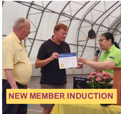
NEW MEMBER INDUCTION