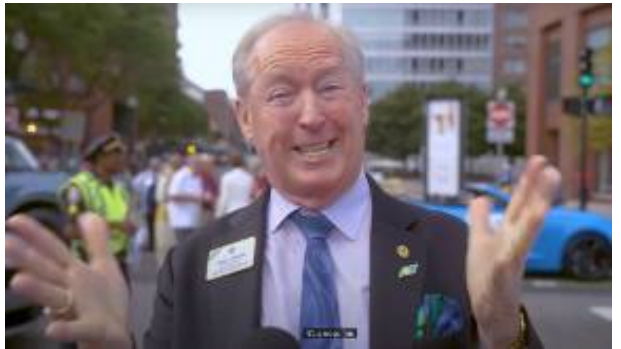
It's all over!!

Miss this year's International Convention? Catch up on everything that happened. Enjoy the best seat in the house with videos showcasing all the highlights of this year's international convention in Boston. https://www.youtube.com/playlist?list=PLjke7HcmOISQWIDvKH61tvfe5BA6UC_qM