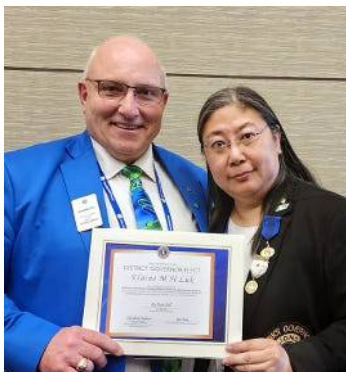
DGE graduation certificate