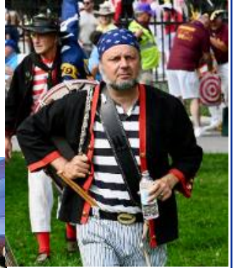
Passing the Gavel