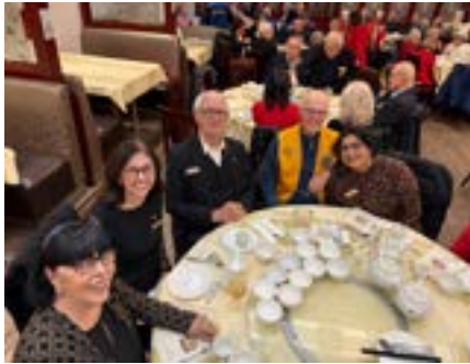
Above: DG Dinner Visit

It's been a busy month for the West Shore Lions. Our Treasurer presented a cheque to the Goldstream Foodbank for $2500 for their Christmas Hampers.