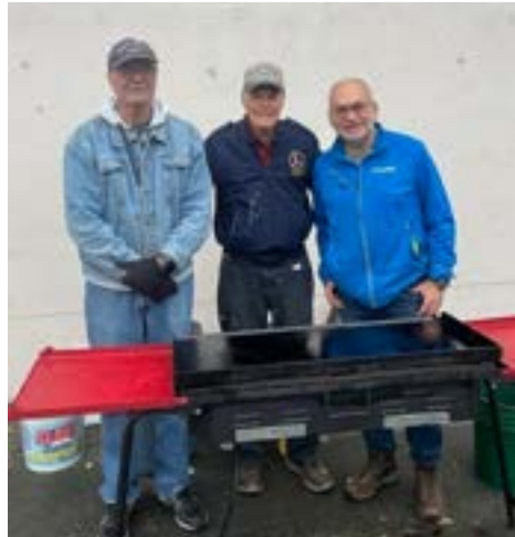
Above: Pancake Breakfast