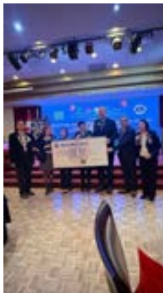
Above: $10K donation to Hong Kong Fire Disaster