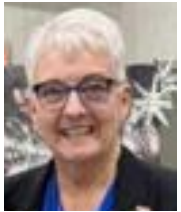
1ST VDG JOJO PAYMENT