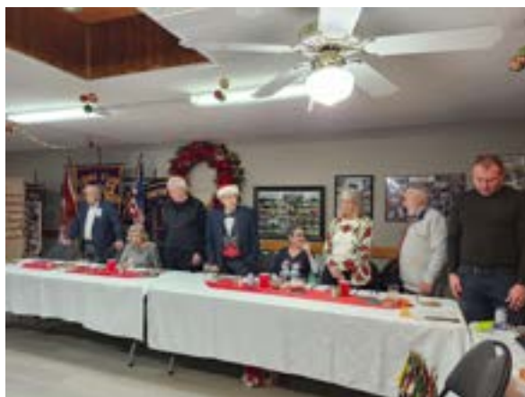
Left: Nanaimo Lions Club Christmas Party